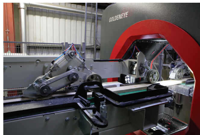
Goldeneye, roofing batten scanning line.

Marley has a wealth of expertise and outstanding knowledge of the roofing and timber markets. At our specialist timber manufacturing site in Gainsborough, timber battens for roofing are manufactured using a state-of-the-art, dedicated roofing batten scanning line, Goldeneye, which scans each timber batten intricately by the millimetre to ensure compliance with BS 5534.